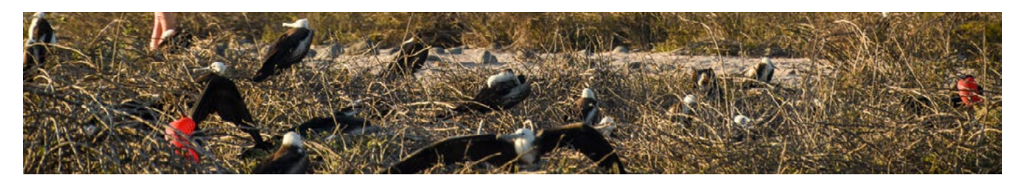
DAY 1 - THURSDAY am - San Cristobal Airport

Departure from Quito or Guayaquil to San Cristobal in a 2-hour flight. Upon arrival, passengers are picked up at the airport by our naturalist guides and taken on a tenminute bus drive to the pier to board the Galapagos Legend .