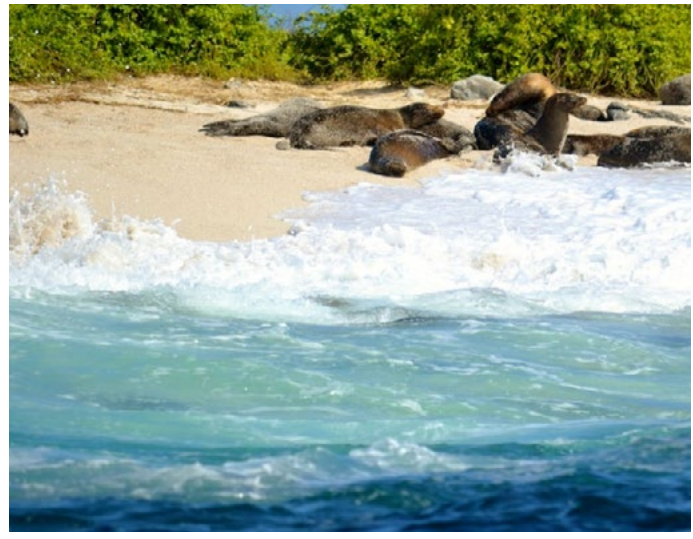
pm – Baltra Island Airport

Difficulty level: easy Type of terrain: none Duration: 1-hour dinghy ride