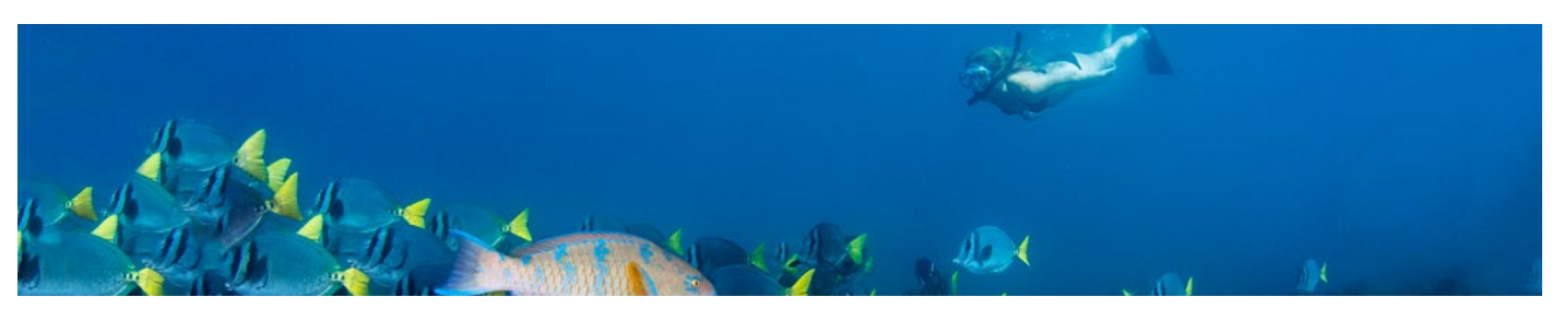
DAY 5 - MONDAY am - Carrion Point (Santa Cruz Island)

Dinghy ride at the entry of the Itabaca Channel in a lagoon with turquoise water, where we can observe sharks, blue-footed boobies, and different kinds of fish.