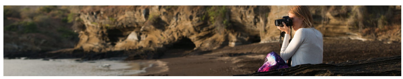
DAY 5 - FRIDAY am - Egas Port (Santiago Island)

Wet landing, Egas Port is a black volcanic sand beach, visited by Darwin in 1835. The first section of the trail is formed of volcanic ash (eroded tuff) and the other half is an uneven terrain of volcanic basaltic rock. The unique, truly striking layered terrain of Santiago shore is home to a variety of animals including the bizarre yellow-crowned night heron and marine wildlife including lobster, starfish and marine iguanas grazing on algae beds alongside Sally light-foot crabs. It is easy to see colonies of endemic fur seals swimming in cool water volcanic rock pools.