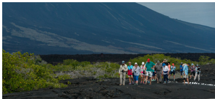
am - Vicente Roca Point (Isabela Island)

Great deep-water snorkeling at one of the richest marine havens on Earth, the Bolivar Channel. Accessible by water, we take a dinghy ride along the coast to observe a great diversity of sea and coastal birds; Nazca and blue-footed boobies, noddies, brown pelicans, penguins, flightless cormorants. The upwelling of cold water currents in this part of the Galapagos gives rise to an abundance of marine life, a perfect place for deep snorkeling.