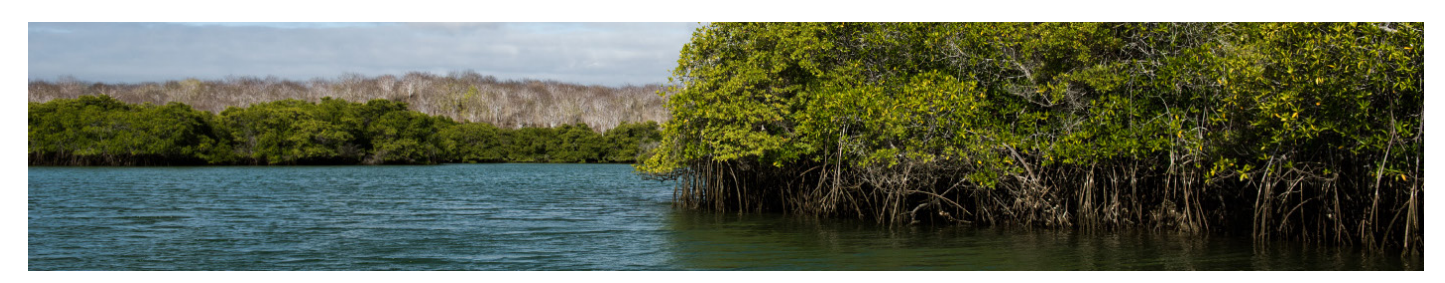
DAY 1 - MONDAY am - Baltra Airport

Departure from Quito or Guayaquil to Baltra Island (2 ½-hour flight). Arriving in the Galapagos, passengers are picked up at the airport by our natural guides and taken to a ten-minute bus drive to the pier to board the ^{\mbox{\scriptsize MV}} Galapagos Legend.