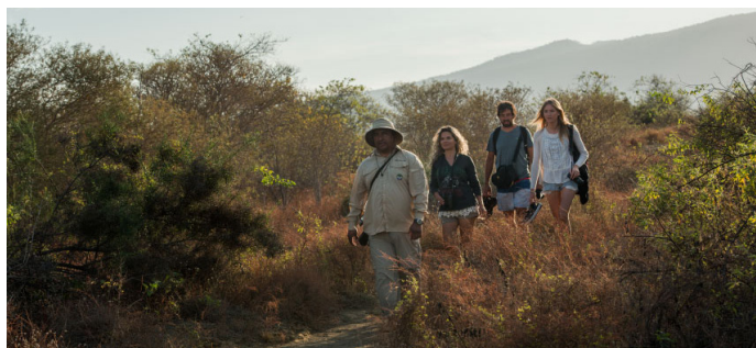
pm - Rabida Island

Wet landing. Dark-red sand covers the unique beaches of this island, home of sea lions colonies; Rabida is considered the epicenter of the Galapagos Islands due to the diversity of its volcanic geology. Nesting brown pelicans are found from July through September plus nine species of the famous Darwin's finches. Here a dinghy ride along marine cliffs is done, to observe nesting seabirds. Snorkel off the coast, where marine life is particularly active.