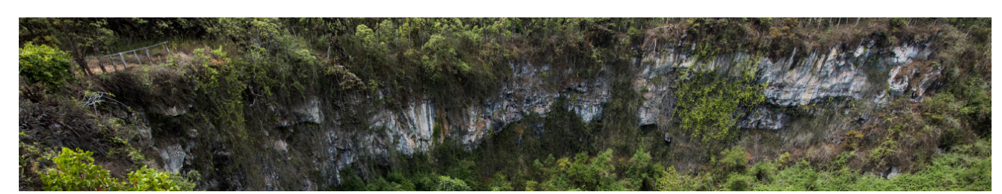
DAY 8 - MONDAY am - Pit Craters (Santa Cruz Island)

Duration: 1-hour snorkeling / 1-hour dinghy ride