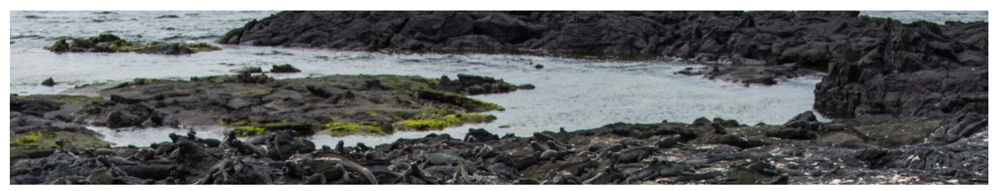
DAY 7 - SUNDAY am - Espinosa Point (Fernandina Island)

Dry landing. From Espinosa Point, is possible to admire a wide view of Isabela Island across the Bolivar Channel, an area that boasts some of the highest diversity of endemic sea fauna in the Galapagos. Here the largest, most primitive-looking marine iguanas are found mingling with sea lions and Sally Lightfoot crabs. Fernandina displays a wonderful opportunity to encounter flightless cormorants at their nesting sites, Galapagos penguins and the "King" of predators on the islands, the Galapagos hawk. Pa-hoe-hoe and AA lava formations cover the majority of Fernandina terrain. Vegetation is scarce inland, with few brachycereus cacti. In the shore mangrove can be found.