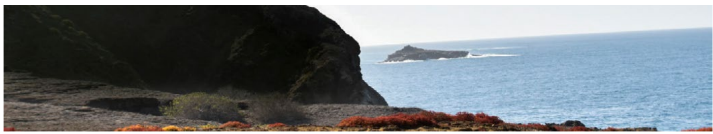
DAY 3 - WEDNESDAY am - Punta Pitt & Islet (San Cristobal Island)

Sea lions will greet us as we land on the beach and prepare for our climb to a high point on the steep eroded tuff cone. This is the only place in the islands where we will enjoy the chance to see all three of the booby species in the same place. The red-foots will be perched on the Cordia lutea and small trees, the Nazcais on the ground near the cliff edge while the blue-foots will be a little further inland. Frigatebirds will be all around and the views are breathtaking.