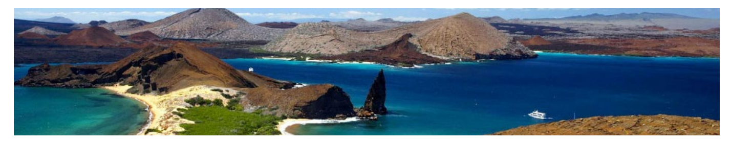
DAY 1 - MONDAY am - Baltra Airport

Departure from Quito or Guayaquil to Baltra Island (2 ½-hour flight). Arriving in the Galapagos, passengers are picked up at the airport by our natural guides and taken to a ten-minute bus drive to the pier to board the ^{\mbox{\scriptsize MVY}}\mbox{\bf Galapagos Legend}.