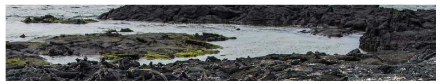
DAY 4 - SUNDAY am - Punta Espinosa (Fernandina Island)

Duration: 2-hour walk / 40-minutes dinghy ride / 1-hour deep water snorkeling