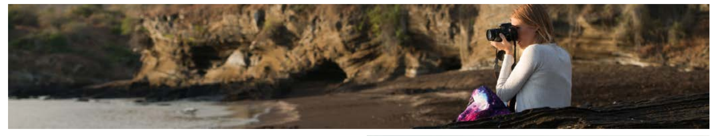
DAY 2 - FRIDAY am - Egas Port (Santiago Island)

Difficulty level: easy Type of terrain: sandy Duration: 1 ½-hour walk & snorkeling