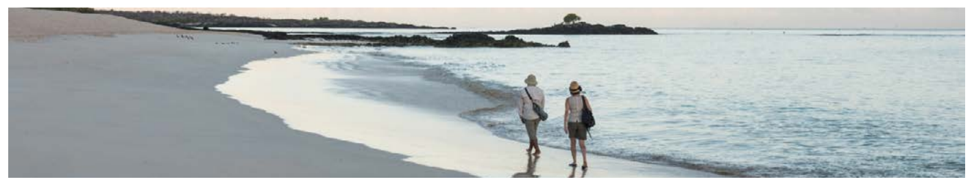
DAY 1 - THURSDAY am - Baltra Airport

Departure from Quito or Guayaquil to Baltra Island (2 ½-hour flight). Arriving in the Galapagos, passengers are picked up at the airport by our natural guides and taken to a ten-minute bus drive to the pier to board the <sup>M/Y</sup>Galapagos Legend.