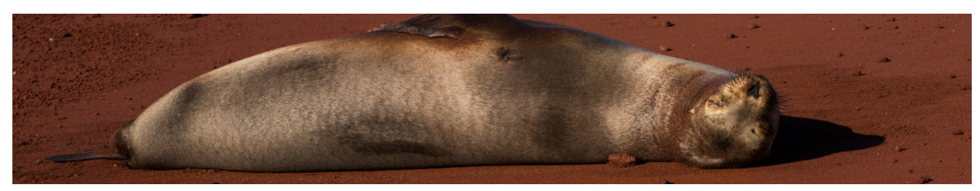
DAY 3 - TUESDAY am - Rabida Island

Wet landing. Dark-red sand covers the unique beaches of this island, home of sea lions vect and infigure a safe to the considered the epicenter of the Galapagos Islands due to the diversity of its volcanic geology. Nesting brown pelicans are found from July through September plus nine species of the famous Darwin's finches. Here a dinghy ride along marine cliffs is done, to observe nesting seabirds. Snorkel off the coast, where marine life is particularly active.