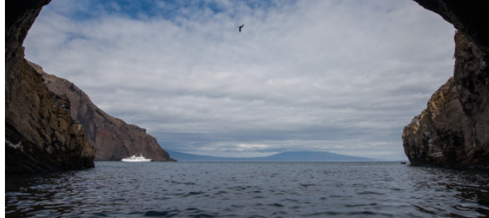
pm - Espinosa Point (Fernandina Island)

Dry landing. From Espinosa Point, is possible to admire a wide view of Isabela Island across the Bolivar Channel, an area that boasts some of the highest diversity of endemic sea fauna in the Galapagos. Here the largest, most primitive-looking marine iguanas are found mingling with sea lions and Sally Lightfoot crabs. Fernandina displays a wonderful opportunity to encounter flightless cormorants at their nesting sites, Galapagos penguins and the "King" of predators on the islands, the Galapagos hawk. Pa-hoe-hoe and AA lava formations cover the majority of Fernandina terrain. Vegetation is scarce inland, with few brachycereus cacti. In the shore mangrove can be found.