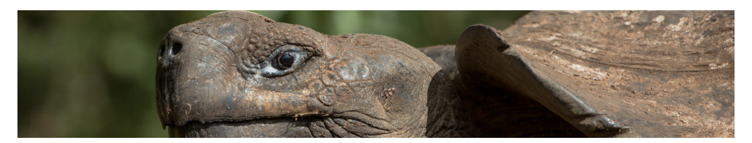
DAY 1 - SUNDAY am - Baltra Airport

Departure from Quito or Guayaquil to Baltra Island (2 ½-hour flight). Arriving in the Galapagos, passengers are picked up at the airport by our natural guides and taken to a ten-minute bus drive to the pier to board the {}^{M/Y} Coral I or {}^{M/Y} Coral II.