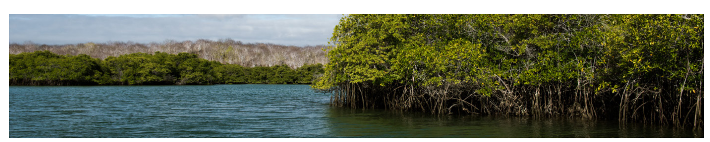
DAY 4 - Wednesday am - Black Turtle Cove (Santa Cruz Island)

Duration: 1-hour walk / 1-hour snorkeling / beach time