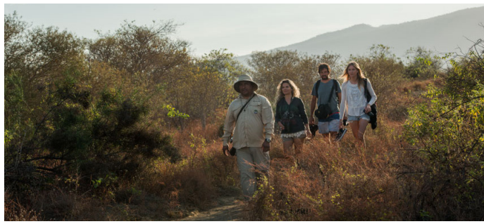
pm - Sullivan Bay (Santiago Island)

Wet landing. This site located at the southeastern portion of Santiago Island is of important geologic interest. It features extensive relative young pa-hoe-hoe lava flows formed during the last quarter of the 19th century. In the middle of the lava flow, older reddish-yellow-colored tuff cones appear. Mollugo plants with their yellow-to-orange whorled leaves usually grow out of the fissures. Walking on the solidified lava gives the impression of been in another planet. Tree molds are found, indicating that in that position large size plants grew in small crevices, until the lava flow of past eruptions burned down the flora of the island.