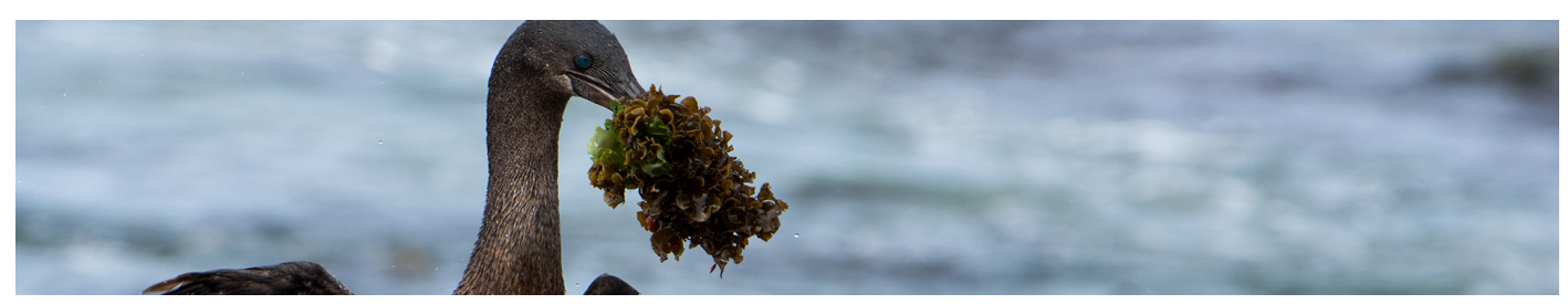
DAY 5 - THURSDAY am- Vicente Roca Point (Isabela Island)

Great deep-water snorkeling at one of the richest marine havens on Earth, the Bolivar Channel. Accessible by water, we take a dinghy ride along the coast to observe a great diversity of sea and coastal birds; Nazca and blue-footed boobies, noddies, brown pelicans, penguins, flightless cormorants. The upwelling of cold water currents in this part of the Galapagos gives rise to an abundance of marine life, a perfect place for deep snorkeling.