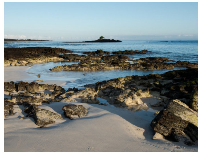
pm - Baltra Island Airport

Difficulty level: easy Type of terrain: sandy Duration: 1-hour walk / beach time