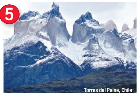
Torres del Paine, Chile