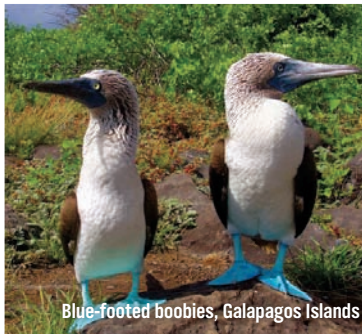
Blue-footed boobies, Galapagos Islands