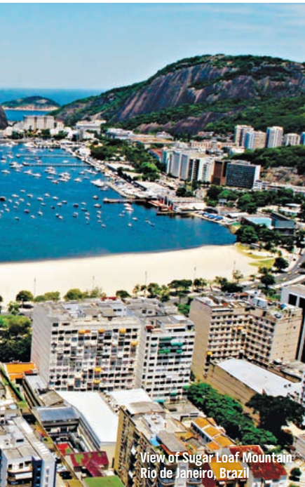
View of Sugar Loaf Mountain, Rio de Janeiro, Brazil