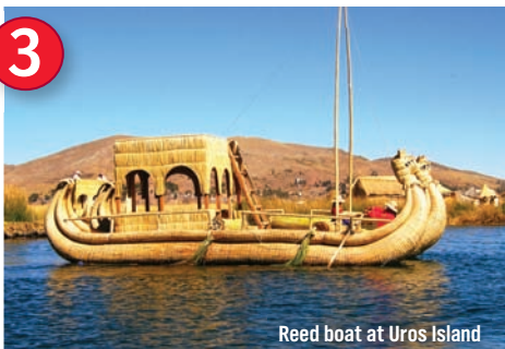
Reed boat at Uros Island