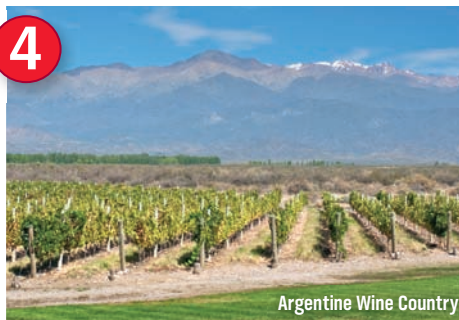
Argentine Wine Country