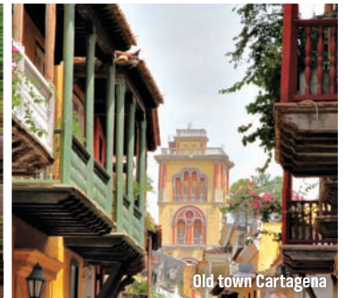
Old town Cartagena

“South America has something for everyone - the entire continent screams authentic, exotic and inviting. My first trip to Peru still ranks as one of the most awe-inspiring experiences ever. Strolling the Inca temples and watching the sun drop over the mountains of Machu Picchu are an experience that can't be matched. The Galapagos Islands touched my soul. The trust and curiosity that the wildlife show toward humans is only matched by the loving pride that Ecuadorians hold for protecting their wonder of nature. Cartagena, the jewel of our newest destination Colombia, is a magical immersion into colonial history, stunning architecture and endless evenings that will leave you dreaming of your return visit.”