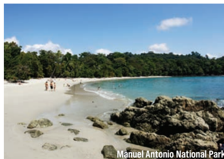
Manuel Antonio National Park