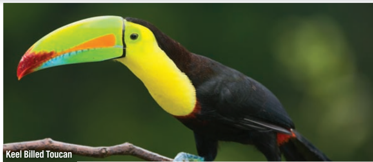
Keel Billed Toucan