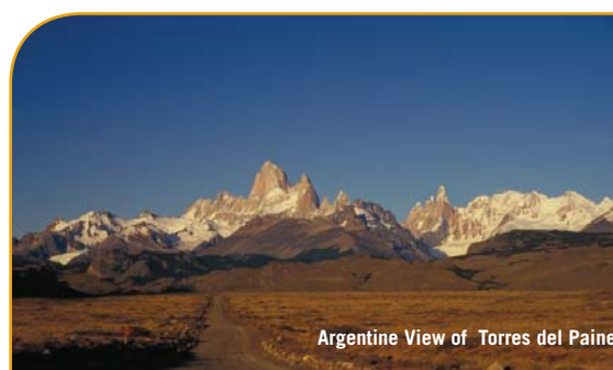
Argentine View of Torres del Paine

Package Includes: All ground transfers; 3 nights Calafate; Perito Moreno Glacier tour with lunch; Upsala, Onelli and Spegazzini Glaciers tour with lunch; 2 nights El Chaltén; 2 days of trekking with lunch and dinner; 1 night Puerto Natales; Torres del Paine National Park tour with lunch; 1 night Torres del Paine; Blue Lagoon tour; 1 night Punta Arena; Daily breakfast.