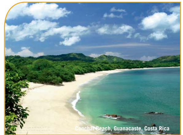
Conchal Beach, Guanacaste, Costa Rica