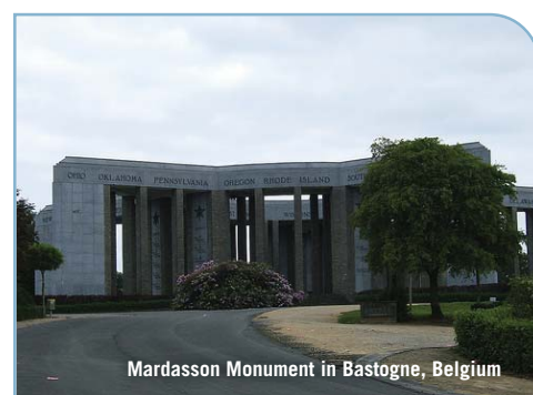
Mardasson Monument in Bastogne, Belgium

Package Includes: 2 nights at 3★ L'Auberge du Sabotier; Welcome present; Gastronomic dinner with wine; 3-day compact manual car rental; Daily breakfast