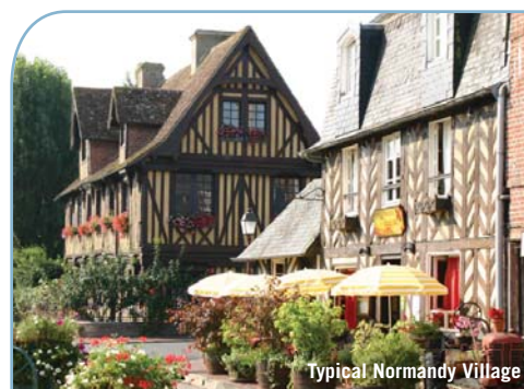
Typical Normandy Village

Package Includes: 2 nights accommodations; Welcome bottle of Pommeau AOC; Visit to gardens of Madame Noppe; Tasting of cider, Calvados and Pommeau at a local cellar; One 3-course dinner including all drinks; 3-day economy manual car rental; Daily breakfast