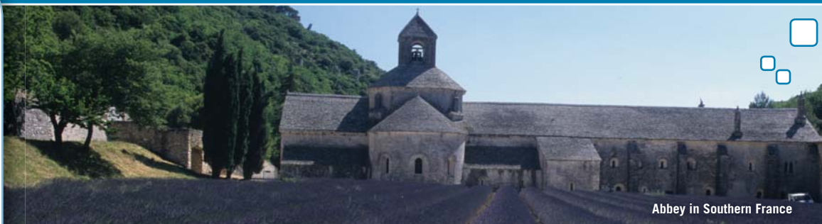
Abbey in Southern France