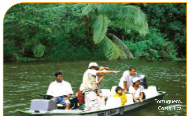
Tortuguero, Costa Rica

Extra nights and alternate itineraries available!