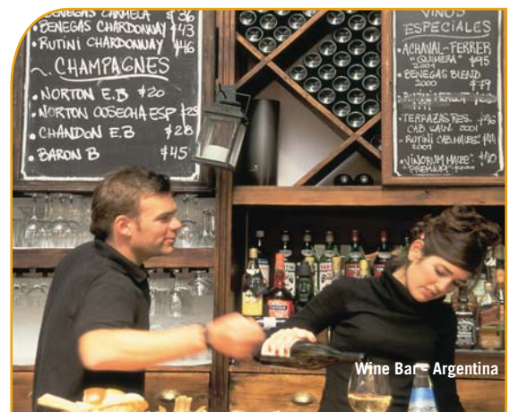
Wine Bar - Argentina

Includes: All ground transfers; 2 nights Buenos Aires at Dazzler Libertad; Carlos Gardel Tango Show with dinner; 3 nights Mendoza at Huentala Hotel Boutique; Private city tour; 2 days of winery visits with lunch; 2 nights Santiago at Plaza San Francisco; 2 nights Chilean wine country at Casa de Cempo; 2 days winery visits with lunch; Daily breakfast