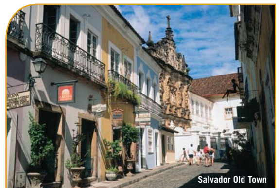
Salvador Old Town

Includes: All ground transfers; 3 nights Salvador at Vila Gale; A visit to the historical Pelourinho District; A visit to the city's main fish and produce markets; Salvador city tour with lunch; 2 dinners; Daily breakfast