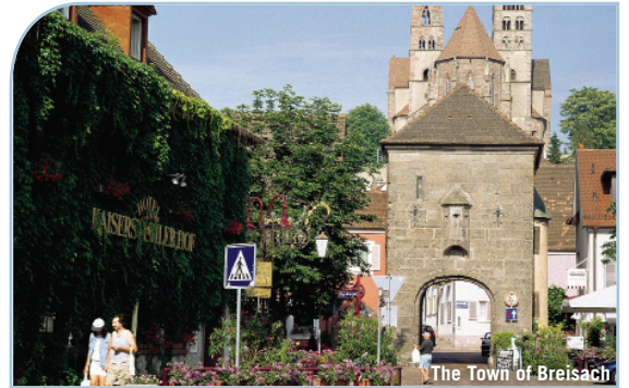
The Town of Breisach

Package Includes: 2 nights at 3★ Kapuzinergarten Hotel; 1 Chef's surprise 4-course dinner with wine; Choice of 2-hr Rhine River cruise or excursion to Black Forest by train & boat; 1 tasting of local wines or Sektt; 3-day compact manual car rental; Daily breakfast