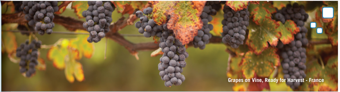
Grapes on Vine, Ready for Harvest - France