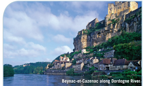
Beynac-et-Cazenac along Dordogne River

Package Includes: 2 nights accommodations; 1 dinner; 1 visit to area wine cellar or vineyard + tasting; 1 visit to local truffle farm + lunch; 3-day compact manual car rental; Daily breakfast