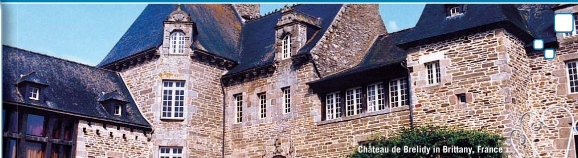
Château de Brelidy in Brittany, France