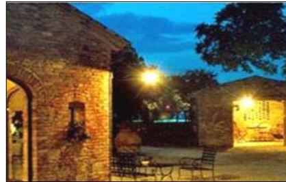
4* Villa Cicolina in Montepulciano Producers of Vino Nobile (From vines softly serenaded by classical music)

For information and reservations, please see your professional travel agent.