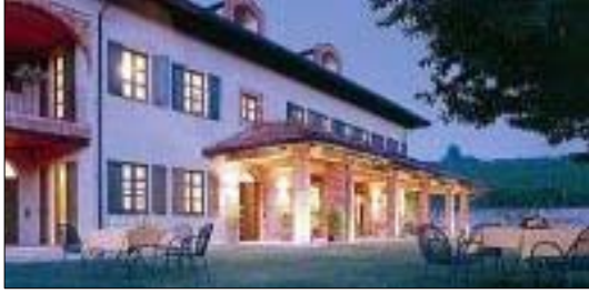
3* Villa Cascina Barac in Alba Producers of Dolcetto d'Alba & Barbaresco wines

Piedmont: This region produces some of Italy's best wines, including Barbera, Barolo, Dolcetto, Gavi and Brachetto. Located between the Alps and the Ligurian Sea, the Piedmont provides a good base for visits to the Cinque Terre and the Italian Lake District.