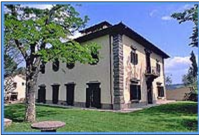
3* Villa Corte di Valle in Greve Producers of Chianti

Tuscany: The most famous of wines are produced here – Chianti Classico, Brunello and Rosso di Montalcino, Vernaccia di San Gimignano, Vino Nobile di Montepulciano – not to mention the wonderful regional cuisine and beautiful scenery.