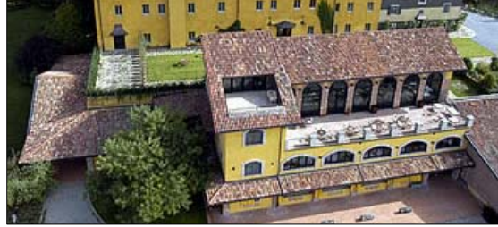
4* L'Ostelliere in Monerotondo di Gavi Producers of Gavi, Dolcetto and Barbera wines

Tuscany: The most famous of wines are produced here – Chianti Classico, Brunello and Rosso di Montalcino, Vernaccia di San Gimignano, Vino Nobile di Montepulciano – not to mention the wonderful regional cuisine and beautiful scenery.