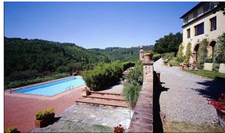
4* Villa Dievole in Vagliagli Producers of Chianti Classicos