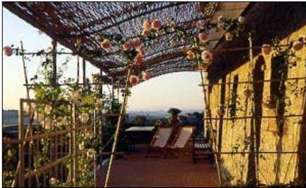
3* Paradiso di Frassina in Montalcino Producers of Brunello