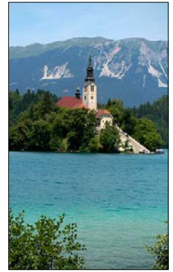
St. Mary's, Bled

(Note: Itinerary can be planned in either order)