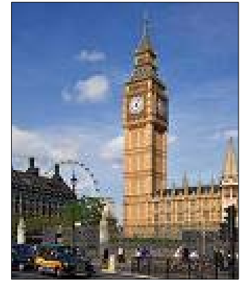
The Tower of "Big Ben"

Experience the historical and cultural highlights of these British capitals visiting and exploring the sights you've heard of for years, such as Westminster Abbey, Buckingham Palace and Edinburgh Castle, at your own pace, based on your interests and desires.