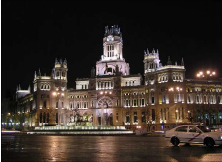
The regal architecture of Madrid

Day 5 ~ Madrid: After breakfast at your hotel, you have a full day with a morning city tour, free time in the afternoon followed by dinner this evening. (Breakfast & accommodation, Madrid)