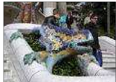
Gaudí's Parc Güell lizard

• Today, arrive on your own for lunch at Marina Moncho's Restaurant with reservations at 1:00 p.m. Moncho's restaurant features grilled seafood, meat and Spanish classics, and is known across Europe for exceptional service, quality cuisine and generous portions. (Please present voucher before ordering, voucher is good for 1 lunch per person; gratuity not included.)