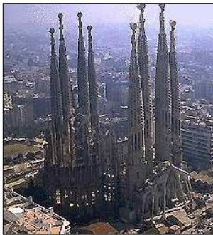
Gaudí's Sagrada Familia

Day 1 ~ Barcelona: Private transfer from the Barcelona airport to your hotel. (Accommodations, Barcelona) Note: Transfers in Spain do not include portage or assistance. Limit: One suitcase and one handbag allowed per person.