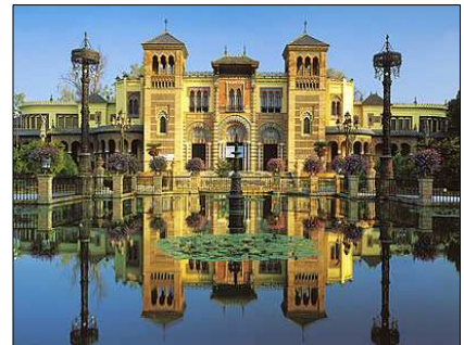
Moorish Palace in Seville

Day 7 ~ Madrid to Seville: After breakfast, meet your driver in the hotel lobby for your private transfer to the rail station where you'll catch your train to Seville with reservations in 1 st class. Once in Seville, meet your driver on the train platform for your transfer to the hotel. (Breakfast, Madrid; accommodation, Seville)