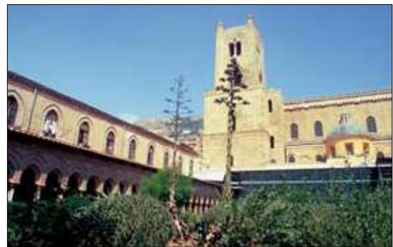
Monreale Cathedral, Palermo

Day 3 ~ Palermo to Agrigento: Pick up your rental car in Palermo before driving south to Agrigento, home of the Valley of the Temples . Along the way, you could visit the archaeological ruins at Segesta , Erice , a lovely medieval town, and Marsala known for its excellent wineries. In Agrigento see the best-preserved Greek temples outside of Greece, dating from the 5th century BC. (Breakfast Palermo; accommodation, Agrigento)