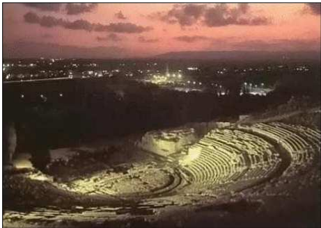
Greek Theater, Siracusa

Day 5 ~ Siracusa to Taormina: Explore the archaeological park in Siracusa, considered by the Roman writer, Cicero, to be the most beautiful of Greek cities before your drive to Taormina. Here you will be in the heart of the Greek heritage on the island, and in the shadow of Mount Etna, Italy's only active volcano. (Breakfast, Siracusa hotel; Overnight in Taormina)