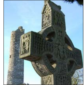
Celtic Cross & ruins, Dublin

E xplore Ireland at your own pace, stopping to experience and enjoy this ancient Celtic Culture as you go! Start in the vibrant capital city of Dublin where you'll enjoy dinner at the oldest pub in town. Discover Ireland's sunny southeast in the crystal city of Waterford. Then marvel at the spectacular scenery along the Ring of Kerry, an easy day-trip from your base in Killarney. Learn about and experience the history of rural life in Ireland with a visit to Bunratty Castle & Folk Park then spend your final night at Dromoland Castle, Ireland's premier castle hotel.