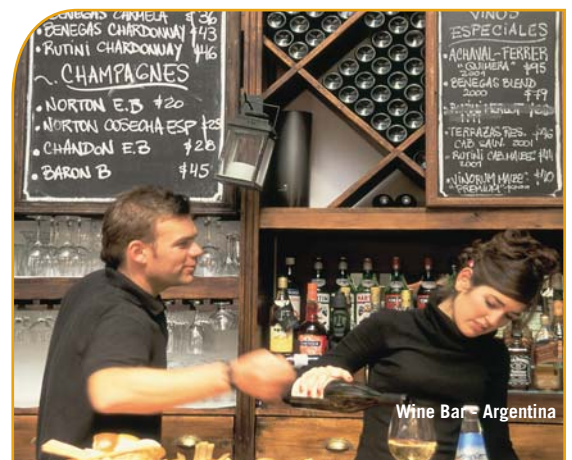
Wine Bar - Argentina

Includes: All ground transfers; 2 nights Buenos Aires at Dazzler Libertad; Carlos Gardel Tango Show with dinner; 3 nights Mendoza at Huentala Hotel Boutique; Private city tour; 2 days of winery visits with lunch; 2 nights Santiago at Plaza San Francisco; 2 nights Chilean wine country at Casa de Cempo; 2 days winery visits with lunch; Daily breakfast