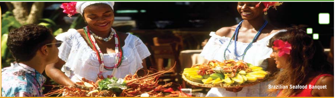
Brazilian Seafood Banquet